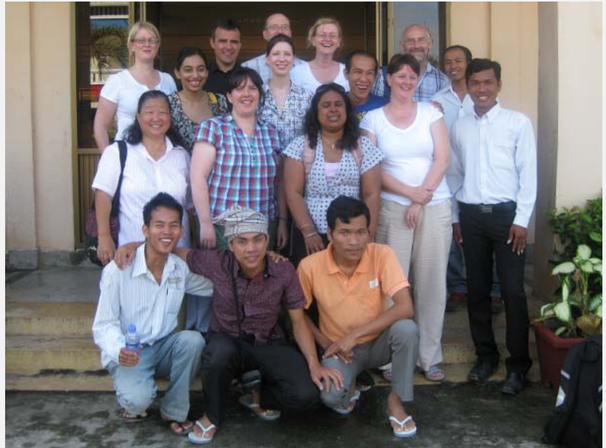
BTBAB Cambodia team and Kone Kmeng staff